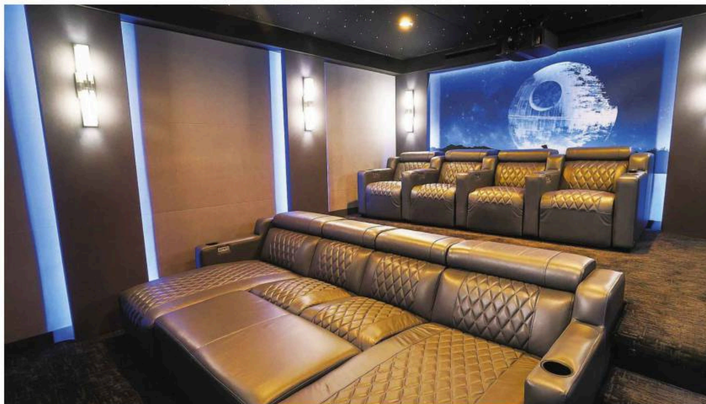
The "Star Wars"-themed home theater in the basement of Ryan DeMarco's Northport home seats eight in plush leather chairs that can recline.